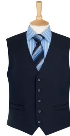
BARI Waistcoat (Black) Cloth backed, 2 welt pockets, 5 button front.

3157A Navy 3157B Navy Multi Stripe 3157D Black 3157E Black Multi Stripe