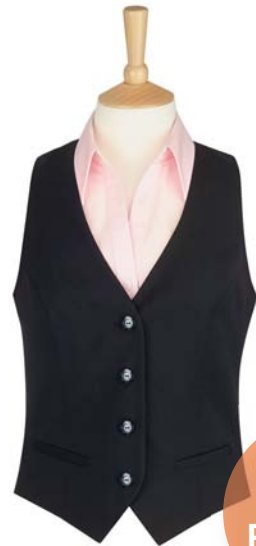
BERGAMO Waistcoat (Black) Cloth backed, 2 welt pockets, 4 button front.

2245A Navy 2245B Navy Multi Stripe 2245D Black 2245E Black Multi Stripe