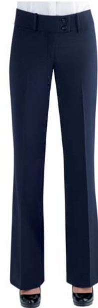
ANDRETTA Trouser (Navy) Low waist, front double button fastening, key card pocket, mock rear pockets, belt loops.

Machine washable 67% Polyester, 30% Wool, 3% Lycra