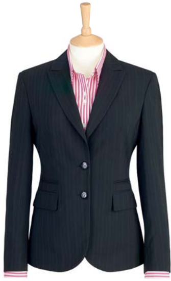
APULIA Jacket (Black Multi Stripe) 2 button, 2 flap & 2 jet pockets, 1 inside pocket, centre vent.

wonderfully tailored fashionable clothing which is machine washable