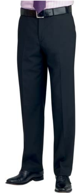
GIGLIO Trousers (Black) Flat front trouser, 2 side pockets, 1 rear pocket.

1072A Navy 1072B Navy Multi Stripe 1072D Black 1072E Black Multi Stripe