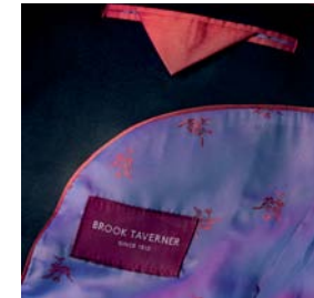
Corporate Fashion collection lining