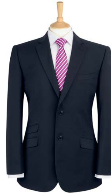
GIGLIO Jacket (Black) Single breasted jacket, slim fit, 2 button front, side vents, ticket pocket, 3 inside pockets, mobile phone pocket.

Machine washable. 67% Polyester, 30% Wool, 3% Lycra