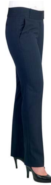
UDINE Trouser (Navy Multi Stripe) Slim leg, front hook fastening, 2 side pockets, mock rear pockets, belt loops.

Machine washable 67% Polyester, 30% Wool, 3% Lycra