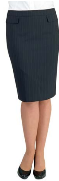
TARANTO Skirt (Black Multi Stripe) Straight skirt, stretch lining, detailed waistband, 2 mock pockets, centre vent.

Machine washable 67% Polyester, 30% Wool, 3% Lycra