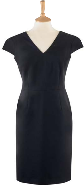
IMPERIA Dress (Black) Versatile V-neck shift dress, capped sleeves, princess seams, centre vent, full stretch lining.

this exceptional collection brings together a high fashion element combined with classic tailoring values