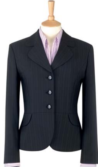
COMO Jacket (Black Multi Stripe) 3 button jacket, rounded lapel and pockets, 1 inside pocket, plain back.

Machine washable 67% Polyester, 30% Wool, 3% Lycra