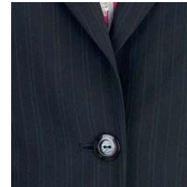
E. Black Multi Stripe