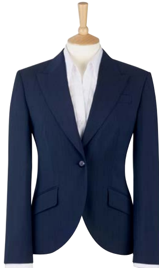
APRILLA Jacket (Navy Multi Stripe) 1 button jacket, double breasted edge-stitched lapel, 2 slant pockets, 1 inside pocket, tailored fit, centre vent.

Machine washable 67% Polyester, 30% Wool, 3% Lycra