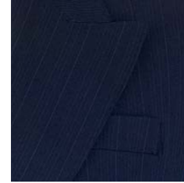
B. Navy Multi Stripe